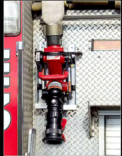
Compact R.A.M. Truck mount